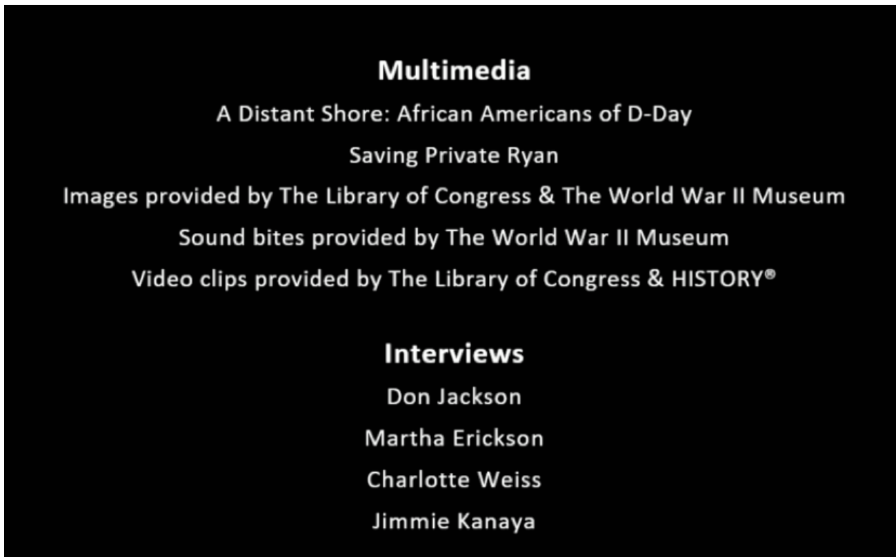
FIGURE 5. EXAMPLE OF A SOURCE CREDIT LIST FROM A DOCUMENTARY